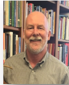
PI: Roland Moore/PhD